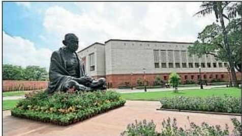
BJP's reaction comes against the backdrop of the opposition INDIA bloc accusing the govt of presenting a 'discriminatory' budget

New Delhi: BJP on Wednesday slammed Congress and other opposition parties for criticising the Union budget, saying that it revealed their political frustration and negative attitude towards "some backward states" that need special focus and assistance for development.